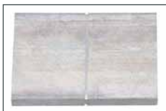
Aluminum test block ASME