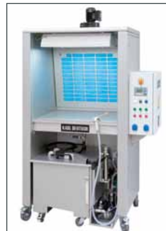
KD-Check test system