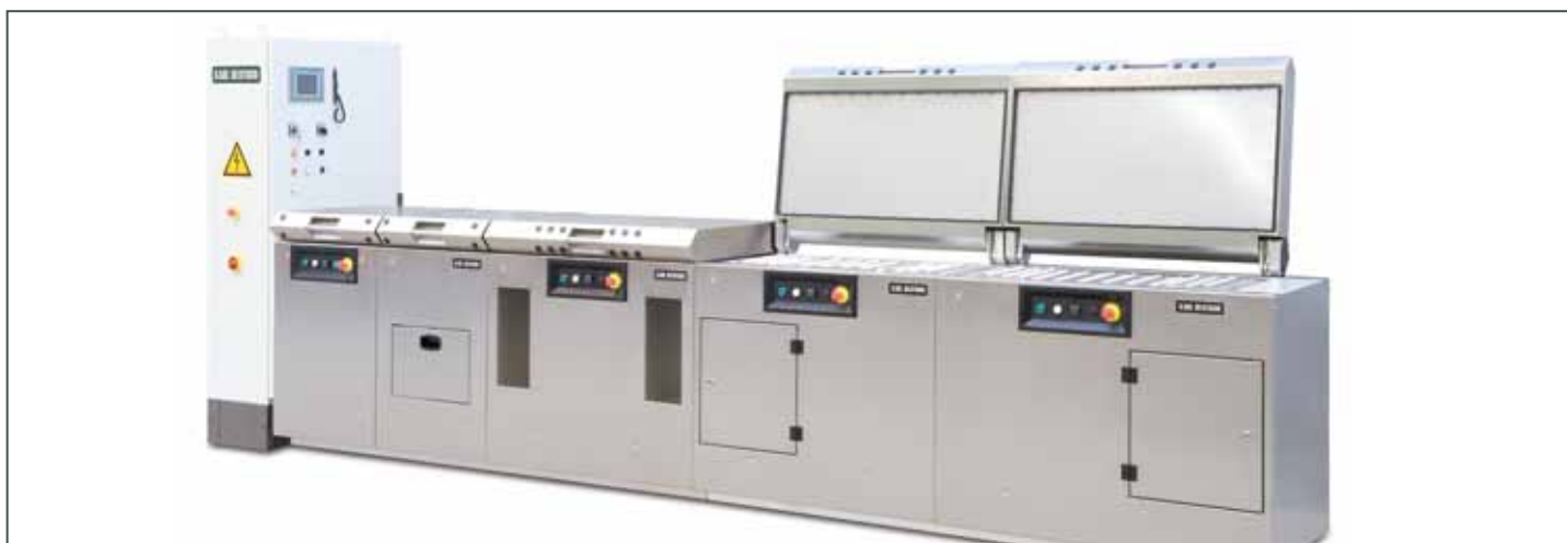
KD-Check test system, semi-automatic

KARL DEUTSCH Prüf- und Messgeräatebau GmbH + Co KG