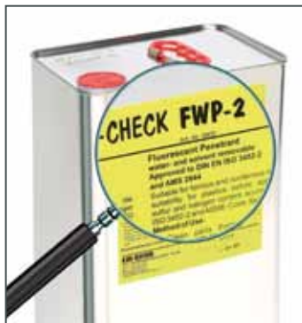
Fluorescent penetrant according to EN ISO 3452 und AMS 2644