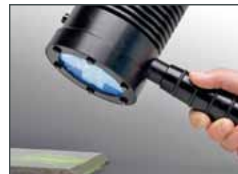
UV-LED hand lamp

We offer for the different applications the appropriate UV lamps: UV-LED lamps as well as UV lamps with conventional technique, large area lamps for stationary inspection tasks and hand lamps for the mobile inspection.