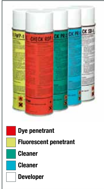
KD-Check agents in spray cans