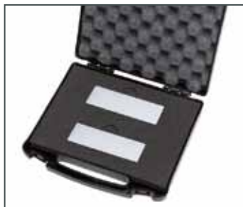
Reference test block 1