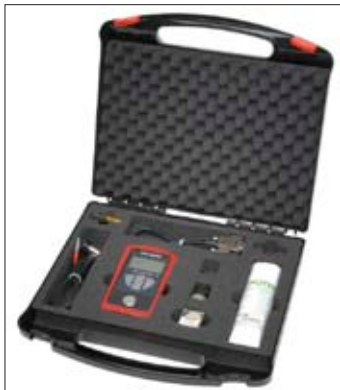
Delivery in a handy carrying case