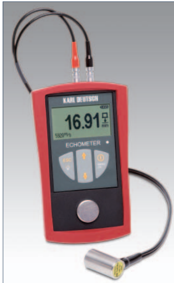
Large, clear graphic display with bright background illumination