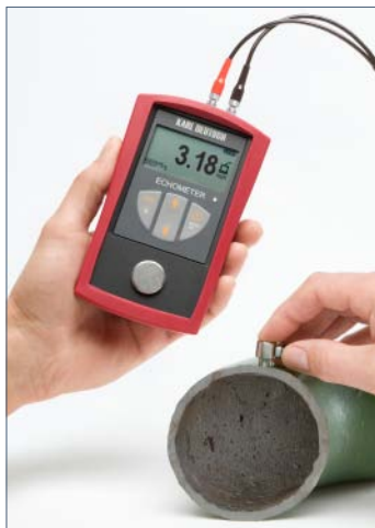
Wall thickness measurement on a tube using the miniature probe