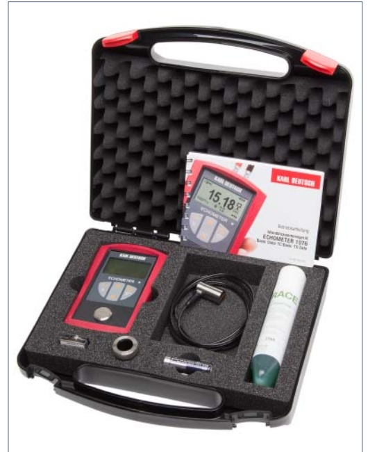
Delivery in a handy carrying case