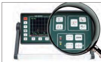
Direct keys for quick settings of important parameters

Optionally, an indication unit with an LED array can also be connected to the device. Thus, the flaw detection of the individual test channels can be clearly seen from a larger distance and under poor lighting conditions.